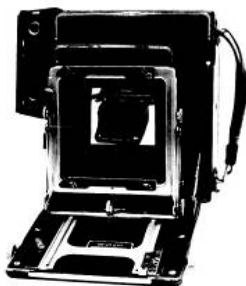
On the cover:

Distribution: Diffusion Parallèle, 1667, rue Amherst, Montréal, Québec, H2L 3L4. Telephone: (514) 521-0335.