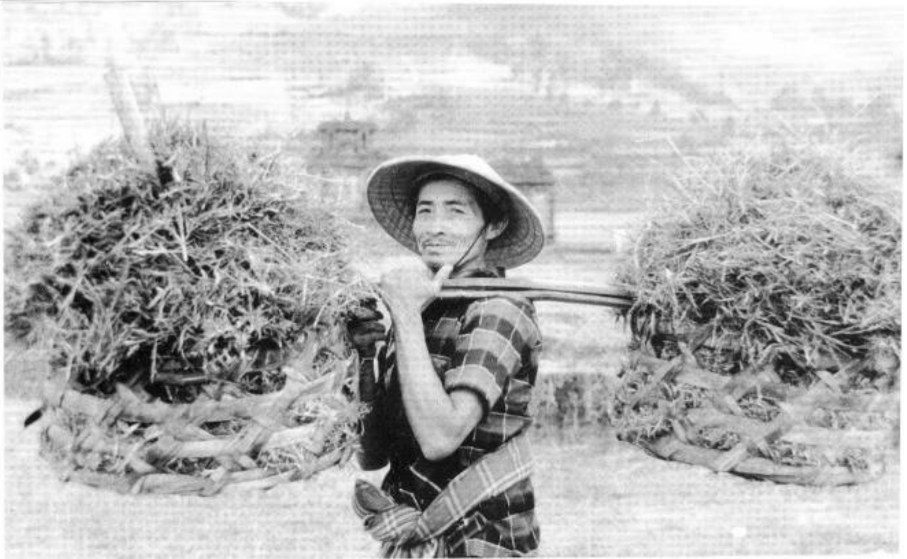
Balanced on a shoulder pole, a double basket eases the task of carrying a heavy load of rice seedlings.

Opposite: Smaller than the Australian kangaroo, the tree kangaroo found on the island of New Guinea has a bushy tail and can climb trees. Like her larger relative, the female carries her young in a pouch.