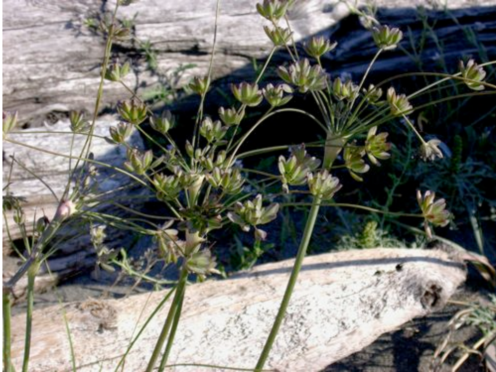
Lomatium nudicaule , below Belly-Rising-Up, Vancouver Island, 21 June, 2004 by Gordon Brent Ingram This is one of the most medicinal and sacred species for the Salish and the Lomatium genus only occurs in western North America. The leaves are also eaten as a vegetable.

Proposal for a transdisciplinary residency from August through October 2015 at Utopiana