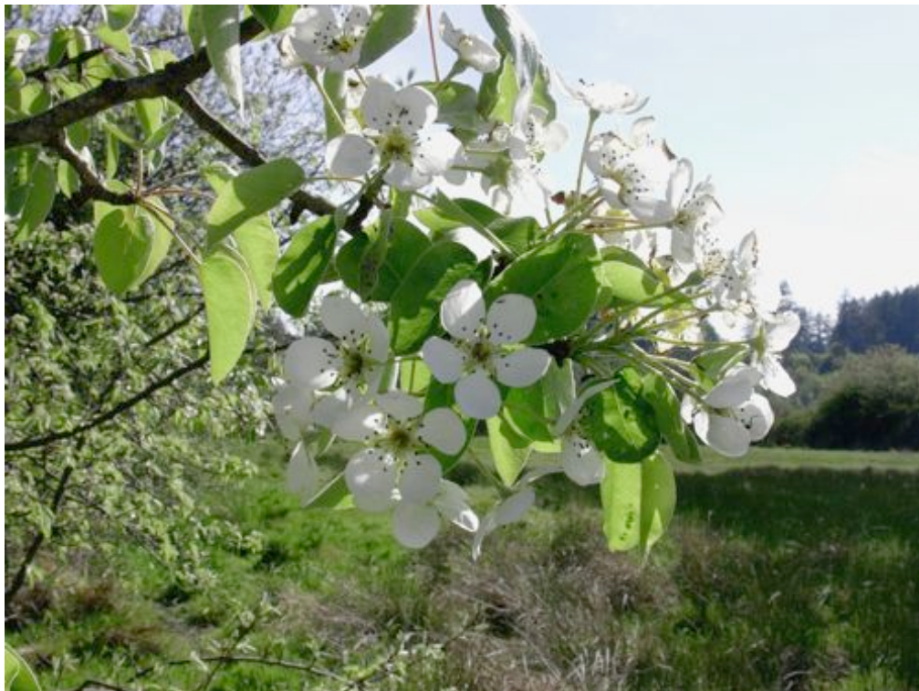
Crab-apple, Malus spp., Belly-Rising-Up, Vancouver Island, 24 April, 2005 by Gordon Brent Ingram This kind of crab-apple was heavily tended and prized by the Salish and is in the same Eurasian gene-pool as apple and pear in Europe. A photograph of its fruit is on the cover page.

www.gordonbrentingram.ca/roof on the cultures of green roofs.